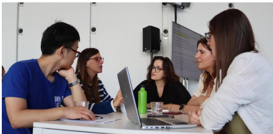
ECOPs discussing in breakout groups.

The Network Forum provided an opportunity for in-depth discussions among participants. Two time slots were exclusively dedicated to brainstorming within small groups (4 to 6 people), focusing on two main themes: 1) How to engage ECOPs in the policy landscape and 2) The future of the ECOP Network, focusing on making recommendations that could help their involvement at the European level, within the EMB, and among EMB Members. Discussions around the first theme led to defining the challenges of being a young scientist when it comes to getting involved in policies. ECOPs specified the challenges they encountered in their careers and proposed solutions to facilitate the communication between science and policy. The second theme was to think of different actions they could take to sustain and develop the EMB ECOP Network. Participants were requested to define what activities would benefit them, as well as what EMB process or organisation should be created to favour ECOPs career development and visibility. After the one-hour discussions, participants were asked to gather back at the conference room for a 30-minute debrief to share ideas. The main outcomes from these discussions described in the first section should be taken into account by EMB Delegates as well as policy-makers to help ECOPs to get involved in European policy-making.